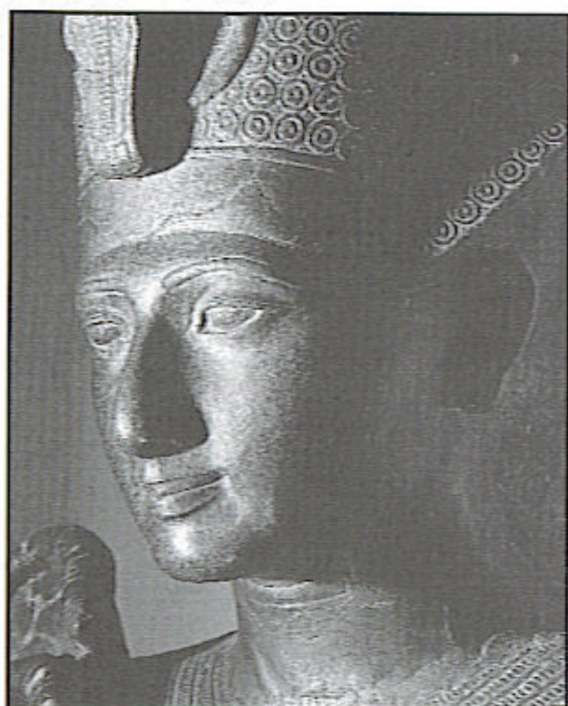
Statue of Ramesses II