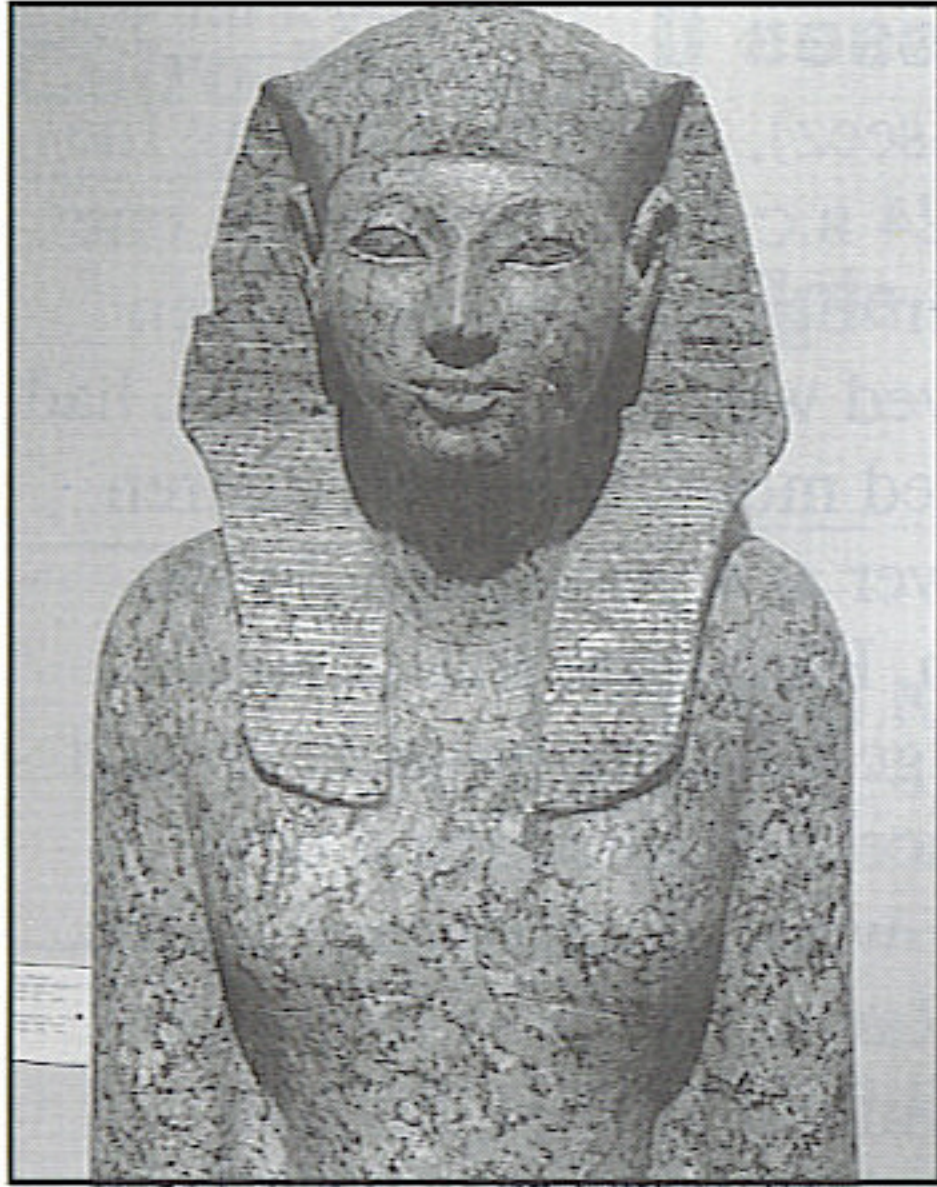
Statue of Hatshepsut